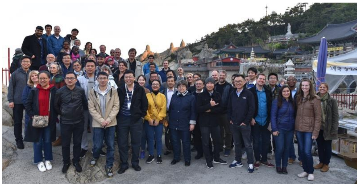
Some of the IOCS-2019 participants at the seaside Yonggungsa temple.